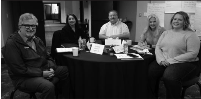
At left are attendees at our PMI: Elected Edition course.

To date, the course has been delivered to 797 supervisor-level prosecutors. Other courses are currently scheduled, and even more offices have expressed a desire to attend it.