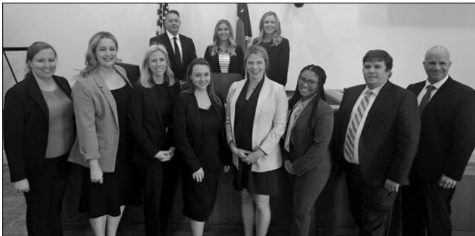
At left and below are attendees at our Advanced Trial Advocacy Course at Baylor School of Law.

To date, the course has been delivered to 392 supervisor-level prosecutors. Other courses are currently scheduled, and even more offices have expressed a desire to attend it.