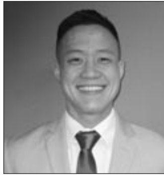
By James Hu

Does mail theft ever get violent? Sure, it does. Our office has filed aggravated robberies in which postal carriers are robbed at gunpoint. What typically becomes apparent is that a good number of these robberies are related to a larger scheme. Certainly, there are robbers out there pointing guns at postal carriers just to steal 12-pack boxes of Poo-Pourri straight from the postal truck (true story). However, the big-ticket item mail robbers want is a mail key—specifically, what's called an arrow key. These are essentially universal keys to open those blue mailboxes sitting out in the open around town where kids drop their letters to Santa. It also opens the cluster/panel mailboxes in subdivisions and apartment complexes for both incoming and outgoing mail. I have also been told of cases where postal carriers provide arrow keys to mail thieves as well.