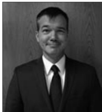
By Brian Klas

So what does this mean for TDCAA training? There is some really hopeful news regarding vaccine development and distribution. Predictions of delivery and final vaccine efficacy offer some guidance on live training and human grouping, but they are inexact. Because the decision to conduct live conferences versus online training must be made well in advance, I've had to make the call on our early 2021 offerings. Due to our funding structure and the nature of hotel contracts, we have no current plans to offer any courses that are simultaneously live and available online.