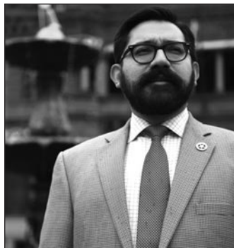
By Joshua Luke Sandoval Assistant Criminal District Attorney in Bexar County

Let's state the obvious: We cannot view the juvenile justice system as a mini version of the adult criminal system. Although there are plenty of shared aspects 1 between them, they are two distinct systems.