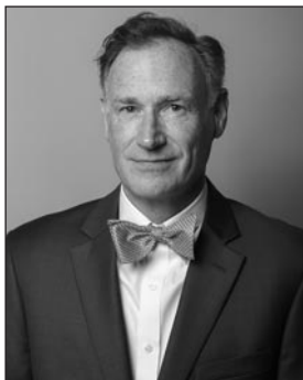
By Rob Kepple

"This honor is reserved for those attorneys who, after decades of practice, have shown a commitment not only for their profession, but also for giving back to their local communities.