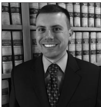
By Benjamin I. Kaminar

The third category includes pretty much any object in existence that doesn’t already fall into one of the first two groups. The key with this category is that the manner of use or intended use refers to the defendant’s use or intended use, not the manufacturer’s intended use. This covers improvised weapons (such as frogs shot out of potato guns) rather than designed weapons. Hammers, rocks, pipes, bricks, the defendant’s own hands and feet, and motor vehicles (one of the most popular) can all fall into this category. Of course, a weapon may qualify under more than one criterion. A handgun is a firearm, but it is also