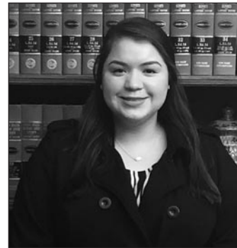
By Monica Mendoza

In addition to collecting a reimbursement fee, the attorney may collect a processing fee (a maximum of $30) 4 for the benefit of the check holder. However, keep in mind that while a processing fee may be collected, the attorney for the State may not charge a processing fee to a drawer