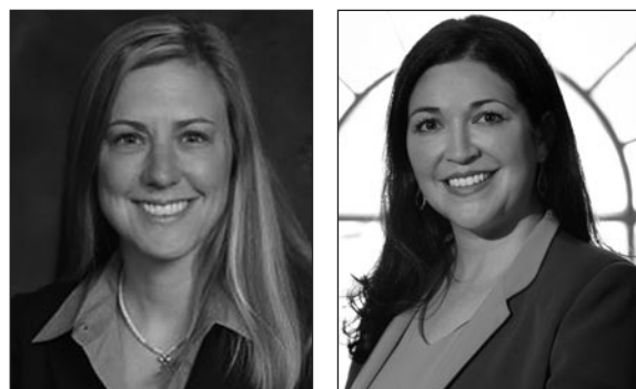
By Traci Bennett (at left)

2) If a defendant is convicted, the evidence must be retained for the duration of the defendant's sentence or community supervision. If a juvenile respondent is adjudicated delinquent, the evidence must be retained for the length of the juvenile's commitment or term of supervision period.