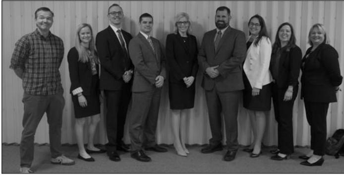
At left are photos of attendees and faculty advisors at Train the Trainer in Fredericksburg.