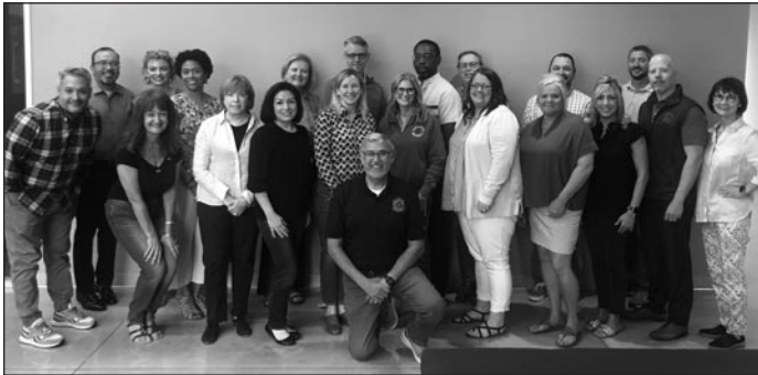
At left and below are attendees at our PMI: Fundamentals of Management courses.

To date, the course has been delivered to 320 supervisor-level prosecutors. Other courses are currently scheduled, and even more offices have expressed a desire to attend it.