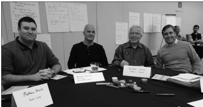
Attendees at our PMI: Elected Edition Course, which was held the same week as our Elected Prosecutor Conference in Rockwall.

To date, the course has been delivered to more than 165 supervisor-level prosecutors. Other counties are currently scheduled, and even more offices have expressed a desire to attend the course. We have even offered two “elected editions” of this course exclusively to elected county and district attorneys; they have been well-attended—see some photos from December 2021’s course below.